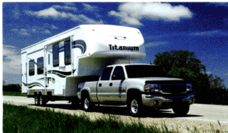
The Titanium Pearl towed like a dream behind our GMC Sierra 2500 HD.

Mount Forest. This region is one of Ontario's many scenic masterpieces, with rolling hills, lush green woodlands, and a babbling brook that is teeming with fish, amid the peaceful quiet that appeals to so many RV travelers.