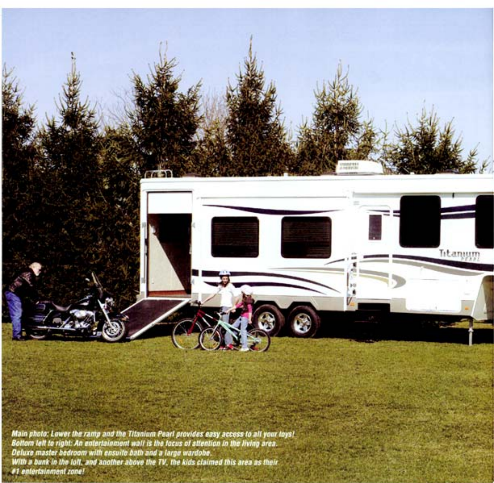
Main photo: Lower the ramp and the Titanium Pearl provides easy access to all your toys! Bottom left to right: An entertainment wall is the focus of attention in the living area. Deluxe master bedroom with ensuite bath and a large wardrobe. With a bunk in the loft, and another above the TV, the kids claimed this area as their #1 entertainment zone!